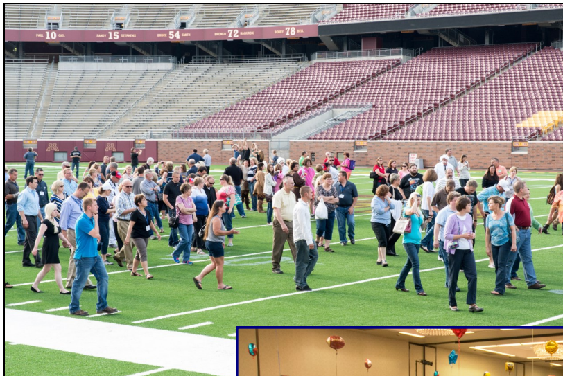
Social Event attendees TCF Stadium got ready to create a big "30" on the 50 yard line of TCF Stadium for the cover of next year's conference brochure. 2015 will be the 30th Annual National Conference.