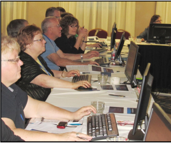
Busy attendees in the Excel lab!